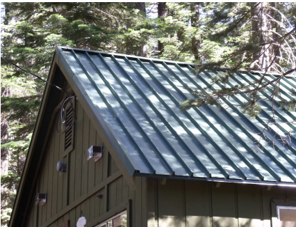
New Steel Roof

Work parties performed several camp improvements and important annual tasks. The big project this year was replacing the roof on the kitchen and dining building. This project was made possible due to a large donation from the Zalesky family and Chevron. The old shake shingle roof was replaced with a steel roof. The new roof is more fire resistant, will not allow as much snow to accumulate, and is expected to last for many, many years. The workers installing the roof used safety harnesses. Jeff Koester organized the roof construction and he and the crew deserve credit for a job well done.