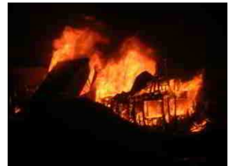
Bucks Lake Lodge on Fire

The Bucks Lake Lodge was burned to the ground on January 20, 2010. Deep snow made it difficult for firefighters to get to the historic structure in time, but they were able to save most of the nearby cabins.