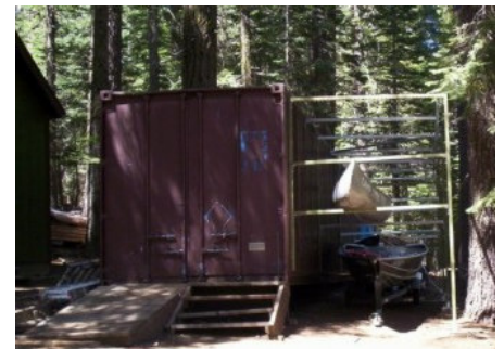
New Boat Rack