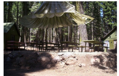
New Level Picnic Area

Pictures of some of the improvements are shown below.