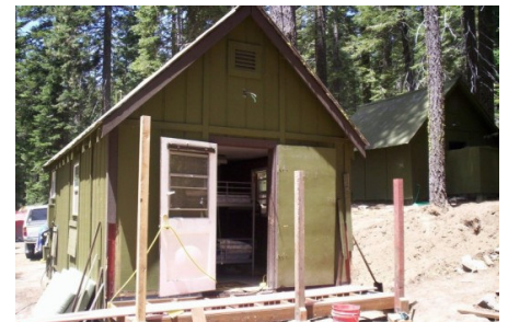
Cabin 2 Porch in Progress